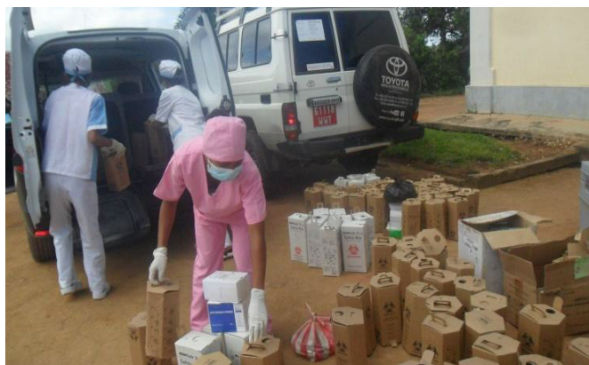
In Madagascar, autoclaving was used to disinfect syringes before disposal

During a measles outbreak in Madagascar , the University Hospital Ravoahangy Andrianavalona (CHUJRA) Ampefiloha assisted in the autoclaving of vaccination waste. Autoclaves used for the hospital's health care waste were deployed to disinfect syringes in sharps boxes from vaccination sites that would otherwise have been open-burned. This was a project funded by Global Environment Facility (GEF) and facilitated by UNDP, WHO, and Health Care Without Harm.