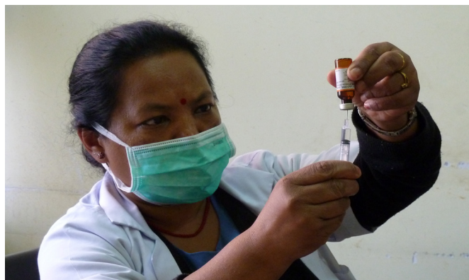
Health Care Without Harm worked in Nepal to safely recycle used syringes

Some of these concepts were tested in 2014 in Nepal , Health Care Without Harm and its strategic partner HEC-AF360 found it was possible to recycle not only syringe plastic, but cardboard and plastic packaging, vials, and aluminum caps. Autoclaving and recycling were found to be more economical and had a lower carbon footprint than incineration or open burning.