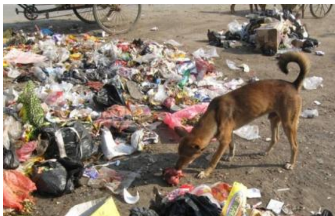
Figure 3. A dog finds some pathological waste on a Kathmandu street.

There is also widespread concern about the level of pollution from China's many incinerators. Harhay et al. (2009) cite a 2007 USAID report describing China's medical waste management as " curing at the front door and poisoning at the back ".