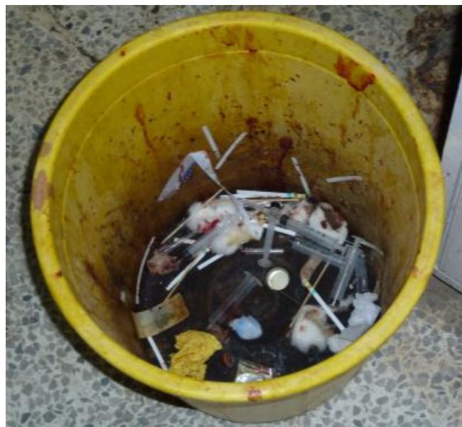
Figure 10. Filthy and blood-spattered bins like this are far too common a sight