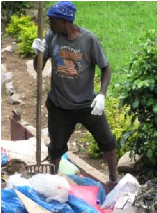
Figure 16. A council subcontractor collecting waste from a hospital in Tanzania wearing only sandals.

at work. They reportedly complain of frequent health problems, but the health authorities do not keep records.