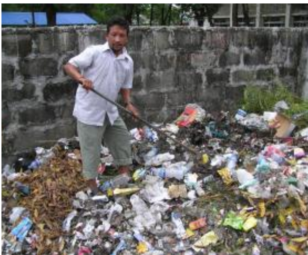
Figure 13. Hospital waste worker in Nepal

According to Ataf and Mujeeb (2002, 2003) hospital workers have high levels of hepatitis B, with medical centre sweepers having the highest levels: 20%. Laboratory workers were also at risk, with staff in only 4.5% using gloves. 12% used protective gowns and 18% used needle cutters, though 64% of labs did have needle cutters, so the problem can be attributed to bad practice as well as lack of equipment.