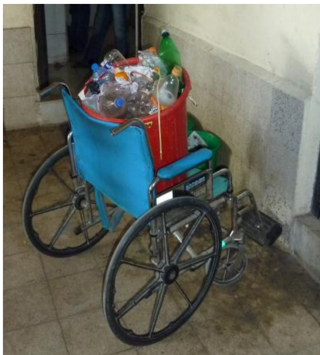
Figure 23. Transporting waste in a wheelchair- just one of many bad practices that can represent a potential source of infection for patients.

In Bangladesh, the products repackaged and sold back to healthcare facilities and the public include: syringes, saline bags, plastic materials, cans and other metals (Patwary et al. 2011c).