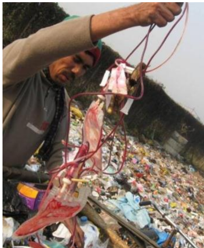
Figure 18. Ragpicker in Kathmandu