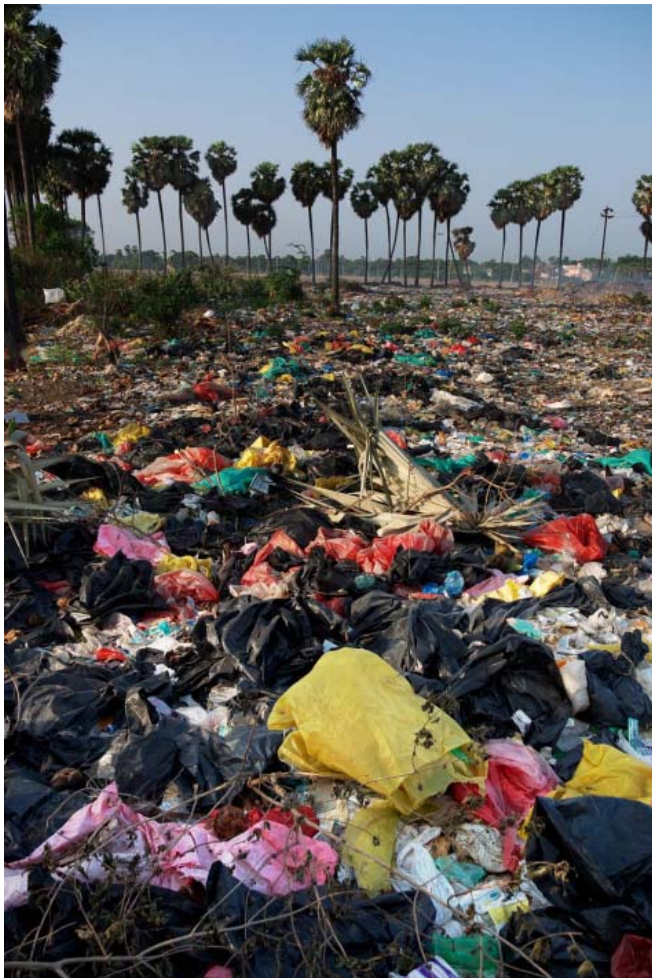
Figure 1. Medical and municipal waste dumped at Pondicherry truck station (Brooks Anderson)

daily, and 240,682kg is treated (IIM 2010). The rest - around 180 tonnes per day, produced by over 36,000 facilities - is either disposed of with municipal waste, dumped illegally, or enters the recycling market. The pictures below are from Pondicherry, in the southern Indian State of Tamil Nadu, where garbage of all sorts is dumped by the truck station.