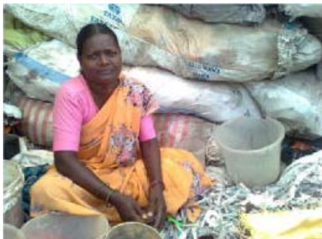
Figure 20. A woman sort syringes at a recycling centre in South India

In India, waste that is destined for the Common Treatment Facilities (CTFs) which are charged with treating waste, often ends up at recyclers instead. Amongst the many examples found in the Indian press, the Jammu and Kashmir state pollution control board seized the driver from a local CTF in the process of unloading untreated medical waste from the CTF vehicle at a scrap dealer's shop. In Bangladesh, the following were reported as being resold: glass bottles, syringes, tubing, discarded/expired medicines syringes, saline bags, tubing, glass bottles, medicines, knives and blades (Patwary et al. 2011a&c). General waste that has been mixed with medical waste is also likely to have picked up pathogens or hazardous materials from the medical waste and will put any waste collector or recycler who handles it at risk.