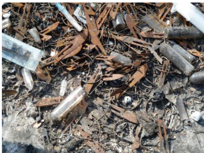
Figure 8. Burning does not destroy sharps, and they can still cause injury

In the 1987, before the current generation of controls were imposed on medical waste incinerators, they were the second largest emitter of dioxin to the atmosphere in the USA,