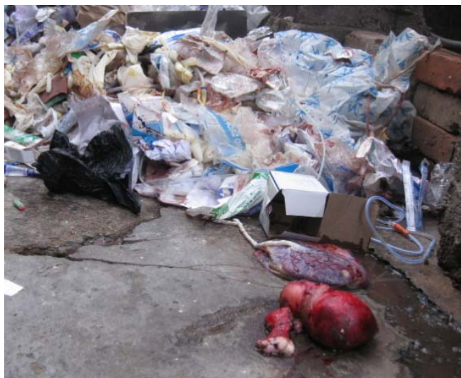
Figure 11. Waste of all types in a hospital yard, awaiting the waste contractor.

73% of waste workers interviewed in Dhaka, Bangladesh were not provided with adequate personal protective equipment (PPE). Only 18% of them wore PPE regularly, and some reported only doing so during when external dignitaries made official visits. Almost all (94%) of them reported having experienced an injury in the previous month. Of these, 28% were regarded as serious by the workers, on the basis of the symptoms they reported (Patwary et al. 2011b&c). A large proportion of the injuries were to the feet, through stepping on sharps, or sharps or chemical injuries to the hands. Many of these would have been prevented by proper PPE).