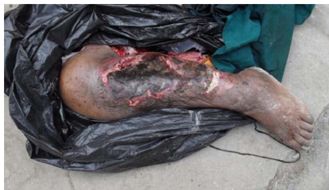
Figure 4. Discovered during a waste audit: a leg destined for disposal via the municipal system.

waste that washes down the rivers during the monsoon, from a variety of illegal dumping sites.