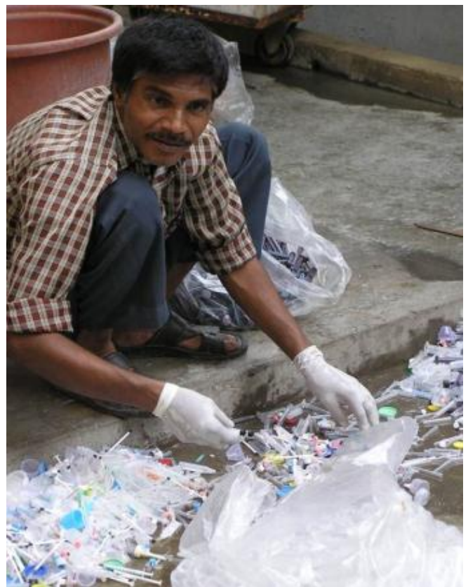
Figure 14. A Delhi hospital worker separates syringes into different plastics before shredding and selling

Pathological waste, including test-tube or slides that have been used to test blood, or bacterial cultures, are among the most dangerous infectious wastes and should be disinfected by autoclaving before further handling of any kind. However, in low and middle income countries, this tends not to happen, because the resources to purchase or maintain a dedicated autoclave are not available. However, the need to save money drives these same facilities to reuse materials, so cleaning staff often wash products such as test tubes and slides that contain blood. This places them at risk of cuts from broken glassware and exposure to blood-borne and other, highly concentrated pathogens.