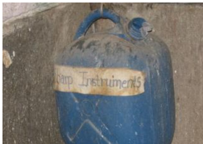
Figure 9. Old plastic bottles make acceptable sharps containers, but they need to be replaced when they are 3/4 full (Stringer/HCWH)

"This is the most important point why the Health Technology Services has moved away from the use of mercury products. The technicians were exposed to mercury when they repaired mercury column sphygmomanometers. Special precautions and equipment is needed if working with mercury products like a dedicated fume/vapour extraction unit within the maintenance department. The mercury is extracted from the device and placed in a special marked container. The container must be able to seal and should remain inside the fume/vapour extraction unit. Once the container is full, the container must be disposed of in a well documented and controlled manner by making use of a recognized hazardous waste disposal company which is very costly" (Pers. Comm 2007).