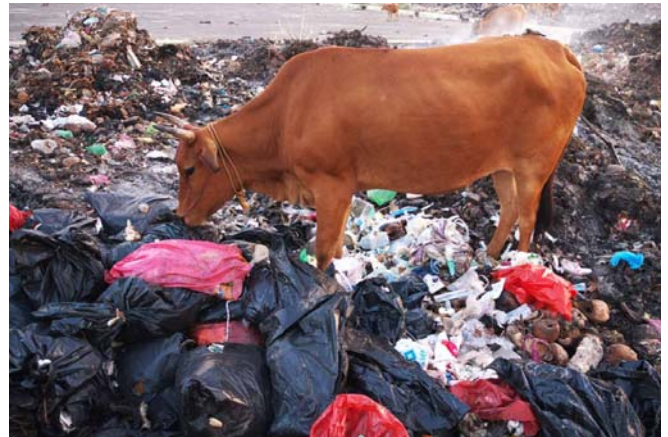
Figure 2. A cow searches for food amongst the red bags of medical waste dumped near the truck station in Pondicherry, India (Brooks Anderson)

being dumped in streams whose waters are used, untreated, for drinking by communities downstream.