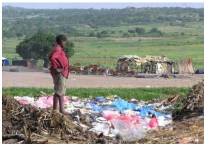
Figure 19. Medical waste at a city dump in Tanzania

Press reports in China have raised the alarm about medical plastics, some of it picked from dumps by ragpickers, being recycled into food contact materials. Uysal and Timnaz (2004) report that medical waste in Turkey is typically disposed of with municipal waste and poses a threat to ragpickers. Similarly, Honduran newspapers reported with concern the mixture of medical waste at the dumps.