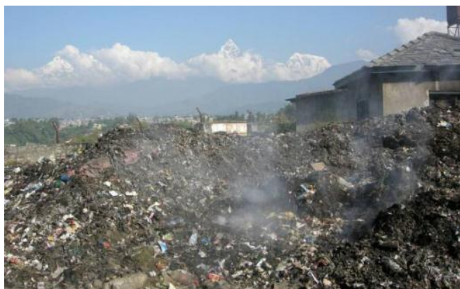
Figure 5. Waste burning in the grounds of a hospital in Nepal. This hospital has cleaned up its site since this photo was taken.