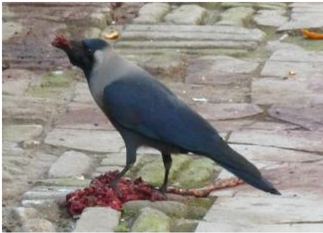
Figure 21. A crow eats a human placenta. The potential for inter-species disease transfer by this route has not been investigated

The potential for diseases to travel between humans and other species is well known. The UK Health and Safety Executive state that there are approximately 40 diseases in the UK that can transfer from animals to humans. Salmonella and influenza (avian flu and H1N1) are amongst the best known zoonoses, and HIV is derived from a similar virus in primates - probably chimpanzees.