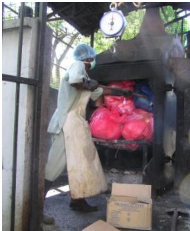
Figure 15. A non-functional incinerator is used as a site to burn highly infectious waste

infectious liquids, or staff injuries from protruding needles or other sharp objects. In 70% of small facilities in one part of Dar es Salaam, Tanzania, waste was carried by hand. Wheelbarrows were used in 40% of facilities in another part of the city.