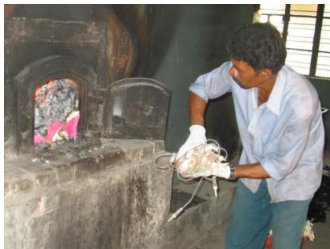
Figure 7. An Indian incinerator operator prepares to throw PVC medical waste into the incinerator, against the biomedical waste rules

Medical waste is often open burned in the premises of healthcare facilities, which is the most polluting practice. Small-scale incinerators, installed in thousands of healthcare facilities worldwide, are also environmentally very hazardous; WHO (2004) recommends that non-incineration waste treatment technologies be promoted to protect people from both the effects of unsafe healthcare waste management and exposure to dioxins and furans.