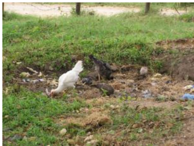
Figure 6. Chickens scratching in a hospital incinerator ash pit in Tanzania.

Regarding dioxins and furans, a modern incinerator, for example, in the EU, is expected to meet a dioxin emission limit of 0.1\text{ng}/\text{m}^3 toxic equivalents (TEQ). This standard has also been adopted by the Stockholm Convention (SSC 2008), which 173 countries have ratified to date.