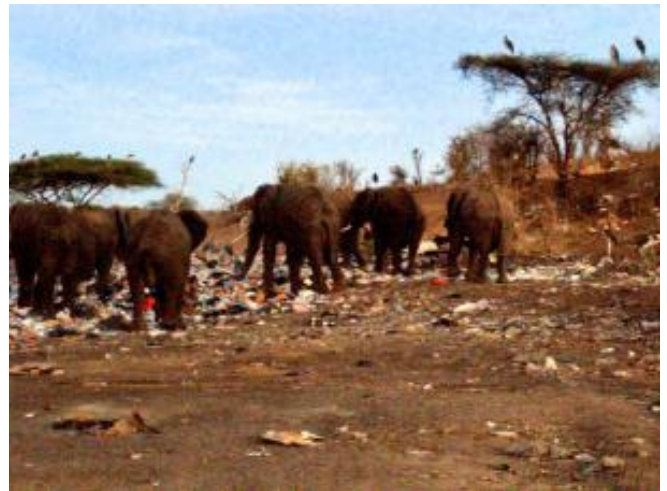
Figure 22. Elephants in Botswana rummage through a dump containing medical waste. They are known to be susceptible to human tuberculosis

However, the possible role of improper disposal of medical waste in spreading human diseases to animals, with the possibility of their being retransmitted to humans either in the same or modified form has not been studied.