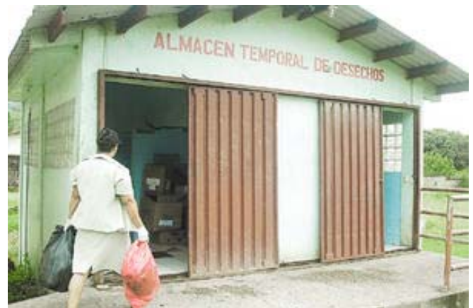
Figure 12. Carrying waste in bags, by hand, risks spills and injuries from protruding sharps.