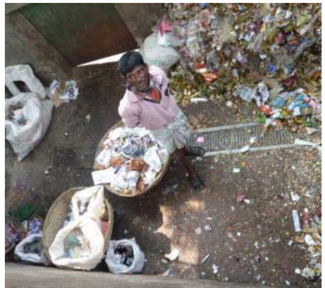
Figure 17. Bangladeshi municipal worker in a hospital. The baskets contain medical devices (eg vials, infusion sets) he has segregated to sell, either for scrap or illegal reuse.

The pictures show similar situations in other countries (Tanzania and Bangladesh). The Tanzanian workers were reportedly subcontracted to the council. The baskets beside the Bangladeshi worker contain a small amount of infusion sets, vials and other medical waste he has sifted out to sell. This is all that is left by the time the waste reaches his station at the back of the hospital. He and others like him are also likely to encounter pathological waste; Bangladeshi hospitals often dispose of unsegregated medical waste of all types, including body parts, to the municipal system (Hassan et al. 2008).