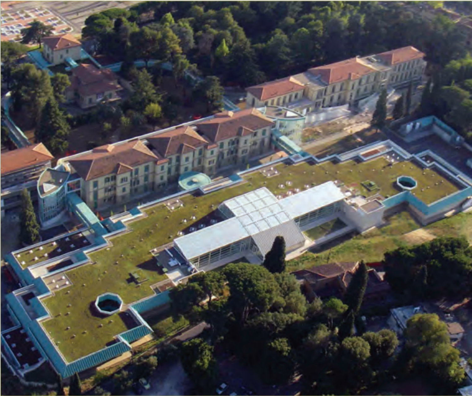
○ Meyer Children's Hospital – Florence, Italy

Many hospitals are using green principles in design and construction