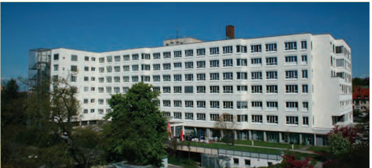
Constance Hospital – Baden-Wurttemberg, Germany