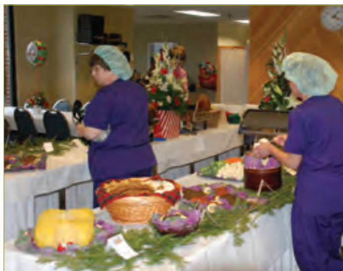
○ St. Luke's Local sustainable food service

USA: St Luke's Hospital, Duluth, Minnesota. This comprehensive care hospital admits over 12 000 patients a year, and treats close to 400 000 more in its many clinics. 78 Over the last decade, St. Luke's has taken steps to make the food it serves to patients, staff and visitors increasingly fresh and sustainable while launching a programme to divert food waste and provide for the local community. Food service staff purchase produce from the local farmers' market and buy products from local vendors, thus reducing emissions from transportation. Since 2003, the hospital has partnered with the group Second Harvest to donate excess food from the hospital kitchen to local families, instead of simply throwing it away. Every day, extra food is labeled and frozen for distribution to local food banks and soup kitchens, providing about 1000 meals a year. The hospital composts almost 40 000 pounds of food waste every year, thus removing it from the waste stream and reducing emissions. This year the facility will introduce an onsite garden as a means to introduce fresh food in the food service operations. 79