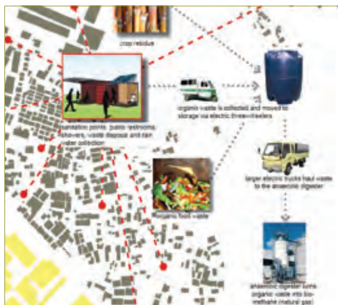
○ Plans for the Embassy Medical Center – Colombo, Sri Lanka